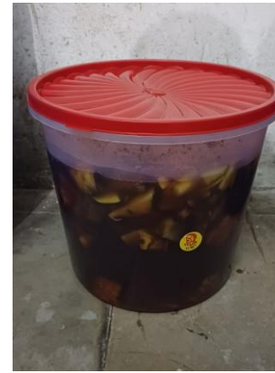
Figure 1. Eco-enzyme fermentation

Two formulations of EE were produced. Bioz1 consisted of pineapple peel, orange, papaya, starfruit, kuini, and mango, while Bioz2 consisted of pineapple, orange, banana corm, noni, and kuini. The raw materials were mixed with molasses and water in a ratio of 1:3:10 (molasses:organic waste:water) and fermented in sealed plastic containers for 100 days at ambient temperature (figure 1).